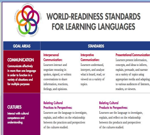
World Readiness Standards

What can the student or teacher participant do as a result of the learning experiences?