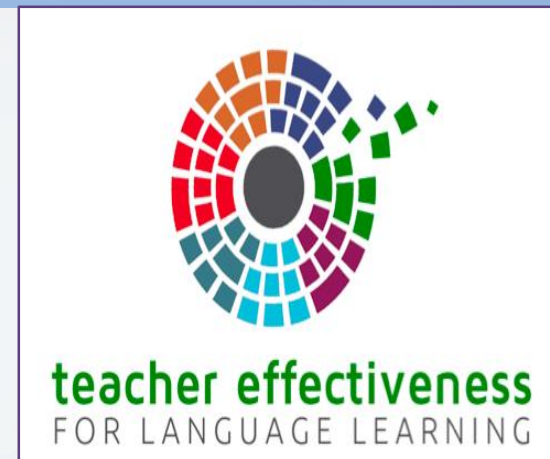
TELL Project Framework