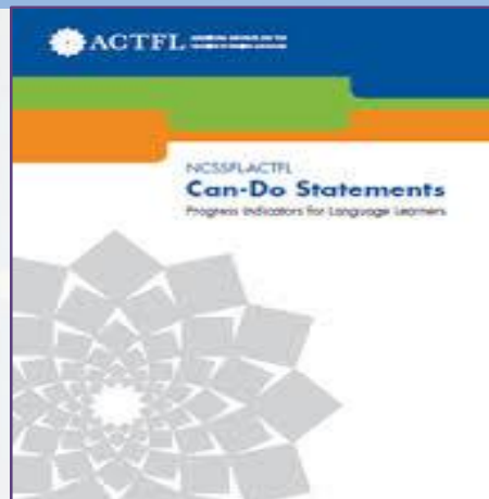
NCSSEFL-ACTFL Can-Do Statements